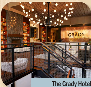
The Grady Hotel 51 rooms