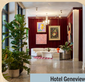
Hotel Genevieve 122 rooms