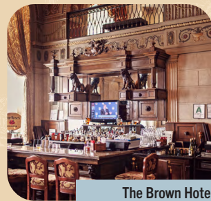
The Brown Hotel 292 rooms