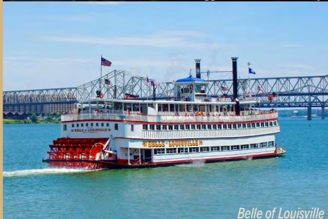
Belle of Louisville