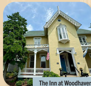
The Inn at Woodhaven 8 rooms