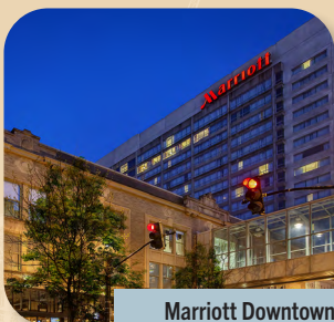
Marriott Downtown 616 rooms