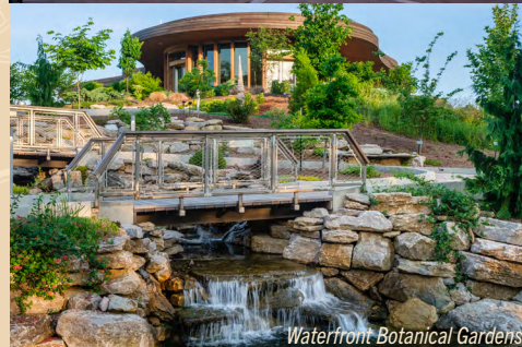
Waterfront Botanical Gardens