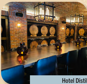
Hotel Distil 205 rooms