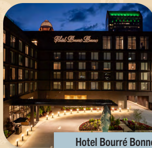
Hotel Bourré Bonne 168 rooms