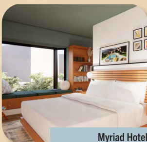
Myriad Hotel 65 rooms