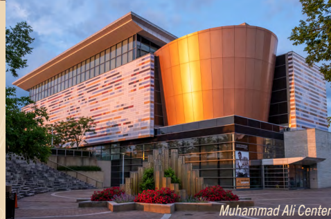
Muhammad Ali Center

Discover a dynamic city where world-class experiences meet Southern charm. Sip your way through Bourbon City, celebrate the thrill of the Kentucky Derby at Churchill Downs, and explore the legacy of global icon Muhammad Ali at the inspiring Muhammad Ali Center. With its rich culture, bold flavors, and unforgettable stories, Louisville is where tradition and innovation come together to captivate every traveler.