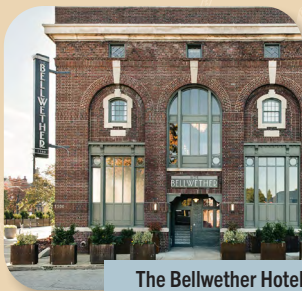
The Bellwether Hotel 20 rooms