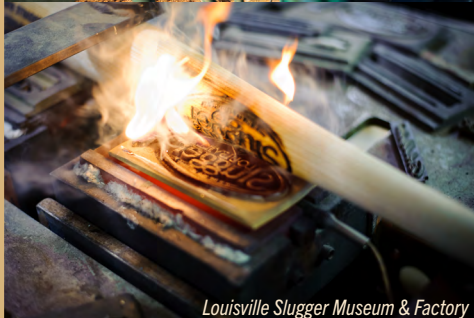
Louisville Slugger Museum & Factory