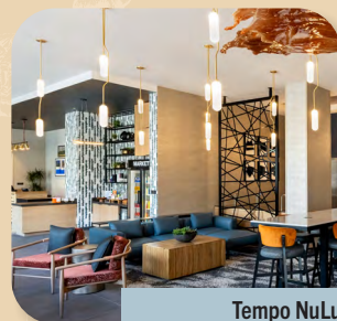
Tempo NuLu 130 rooms