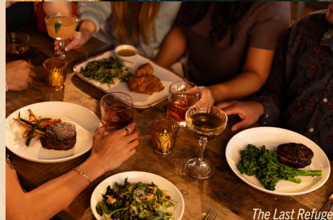
The Last Refuge