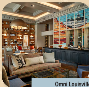
Omni Louisville 621 rooms