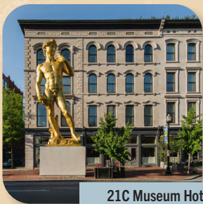
21C Museum Hotel 91 rooms