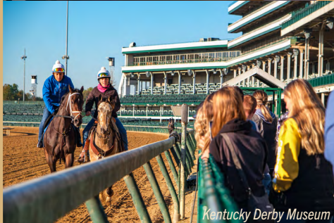
Kentucky Derby Museum